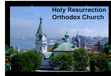
Holy Resurrection Orthodox Church