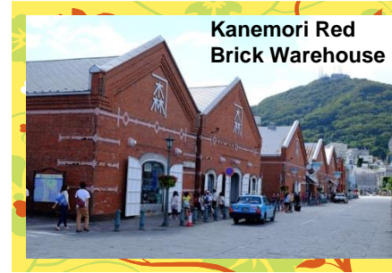
Kanemori Red Brick Warehouse